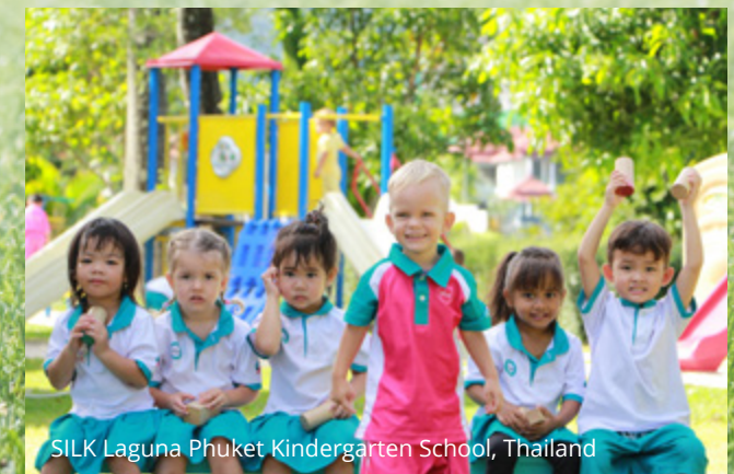
SILK Laguna Phuket Kindergarten School, Thailand