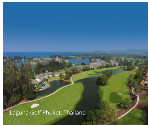
Laguna Golf Phuket, Thailand