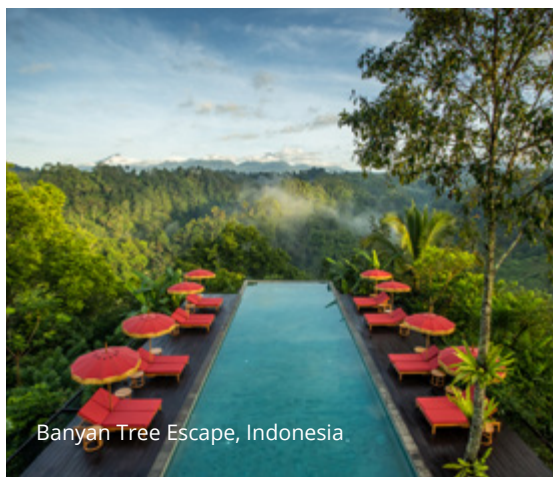
Banyan Tree Escape, Indonesia