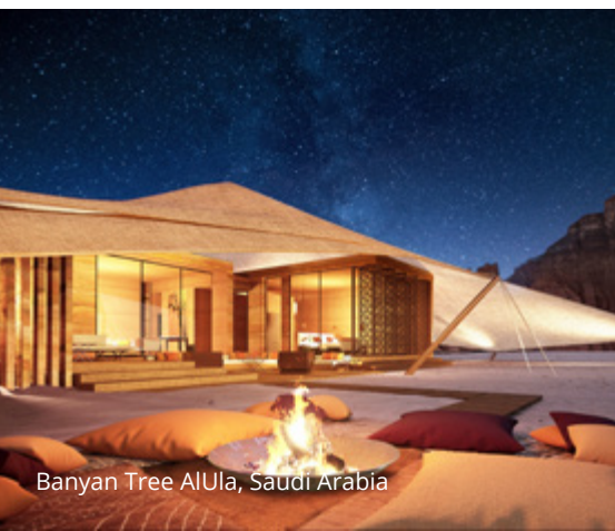
Banyan Tree AlUla, Saudi Arabia