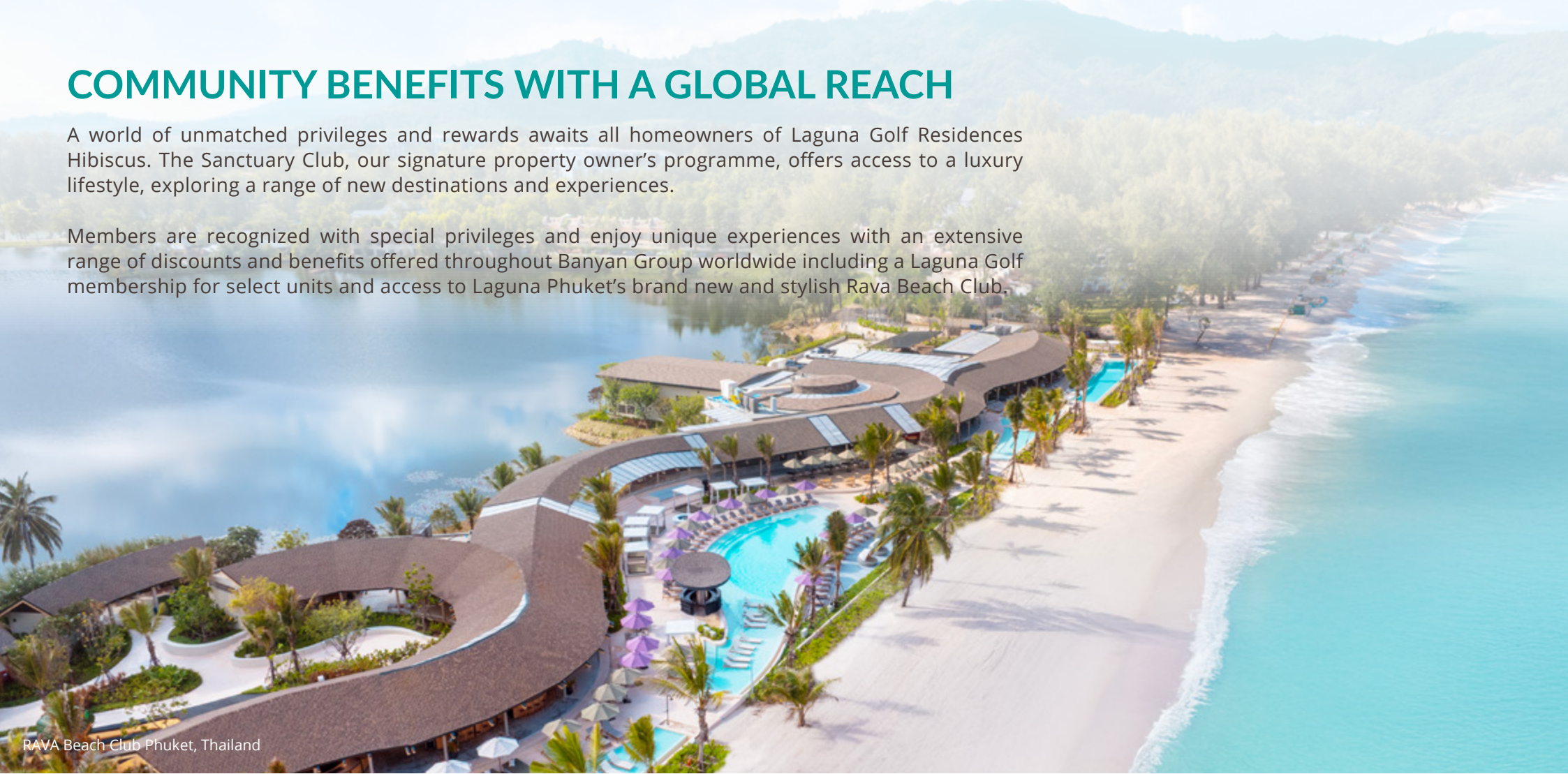
RAVA Beach Club Phuket, Thailand

Members are recognized with special privileges and enjoy unique experiences with an extensive range of discounts and benefits offered throughout Banyan Group worldwide including a Laguna Golf membership for select units and access to Laguna Phuket's brand new and stylish Rava Beach Club.